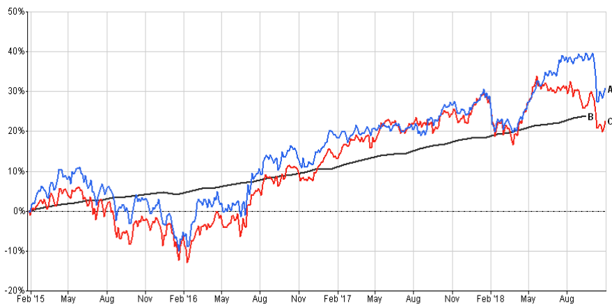
■ A - VT - Castlebay UK Equity A Acc in GB [30.80%] ■ B - UK Consumer Price +4% TR in GB [23.94%] ■ C - MSCI United Kingdom All Cap TR in GB [22.57%] 28/01/2015 - 31/10/2018 Data from FE 2018