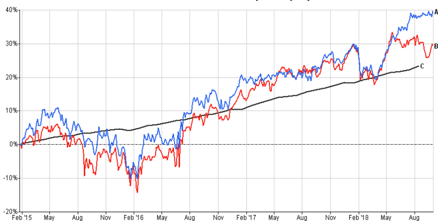
■ A - VT - Castlebay UK Equity A Acc in GB [39.69%] ■ C - UK Consumer Price +4% TR in GB [23.42%] ■ B - MSCI United Kingdom All Cap TR in GB [29.40%] 28/01/2015 - 28/09/2018 Data from FE 2018